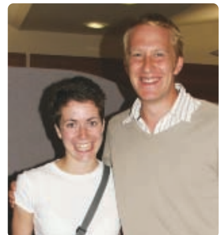
Two OCs enjoying the Day