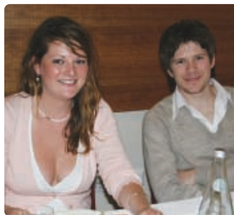
Two of our younger OCs enjoying lunch