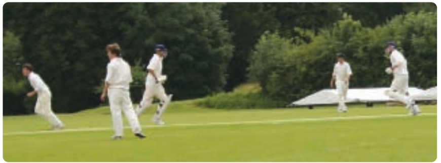
Luckily the skies cleared for the cricket to begin!

Old Boys 160-8.... boys 161-7 ....a good game and great fun!