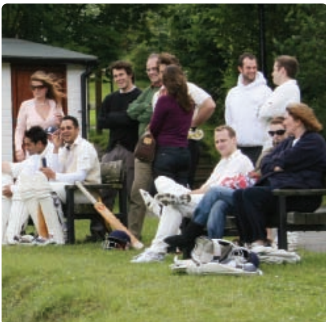
Some of the spectators and players enjoy the match