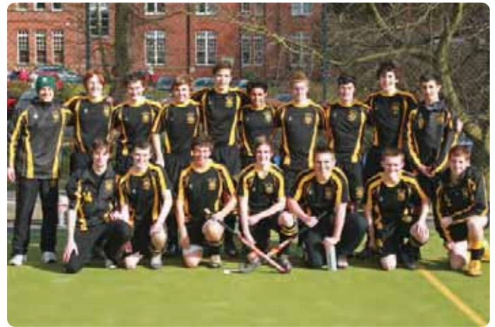
School Hockey Team