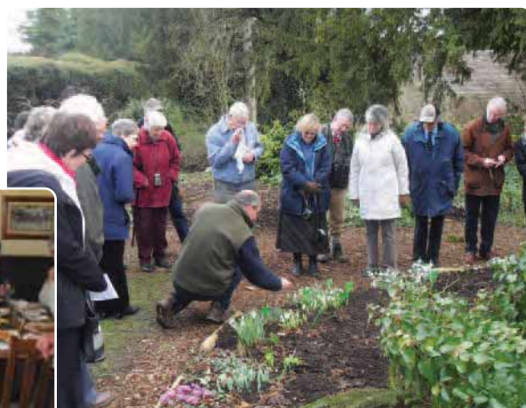
Our President showing us the snowdrop collection