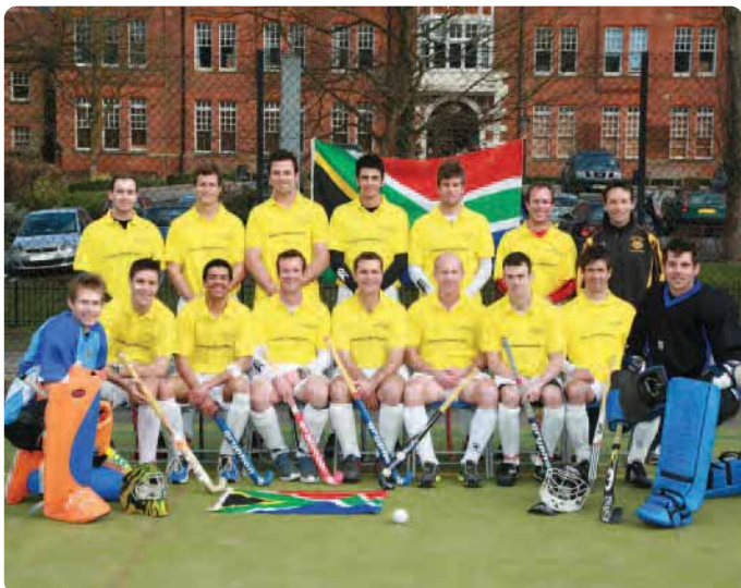
South Africa Team