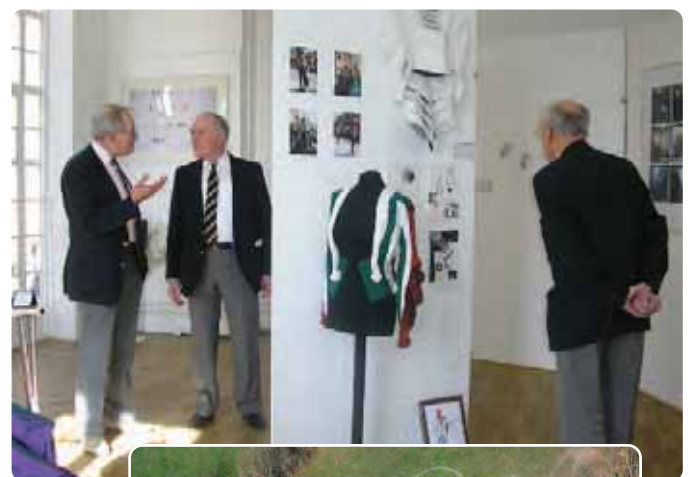
Some Old Boys admire the artwork