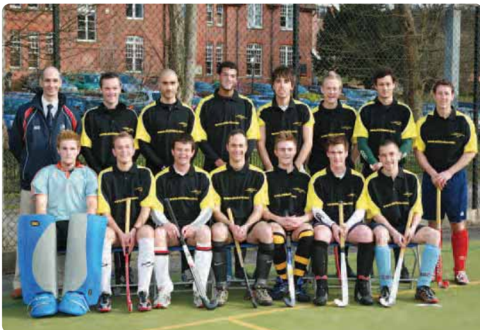
Rest of World and Caterham XI

The afternoon of international sport was appreciated by all who attended and over £500 was raised for the school's charities.