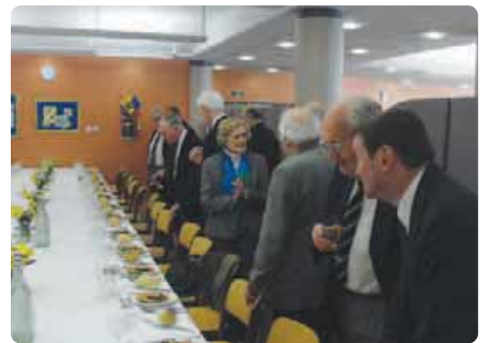
Guests assemble for lunch