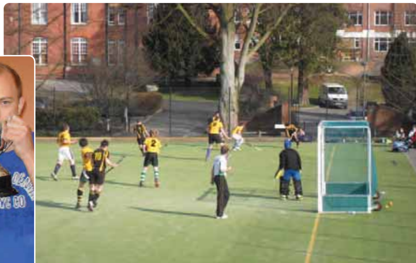
Hockey on 'The Astro'