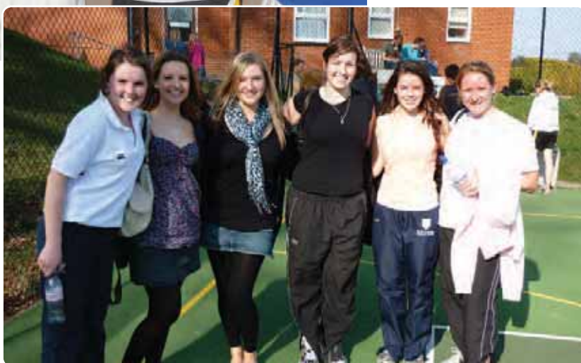
Old Cats Netball Team