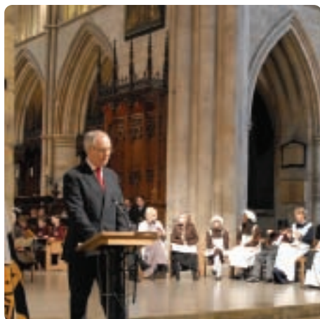
The Service at Southwark Cathedral