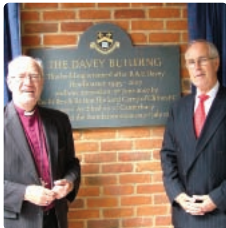
The Opening Ceremony of the Davey Building